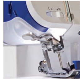
LED work light