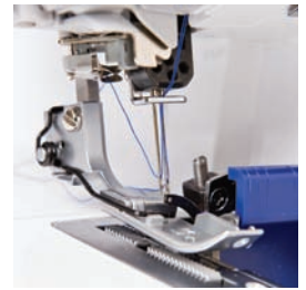
Automatic needle threader