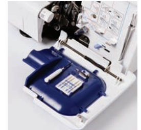
Built-in accessory storage