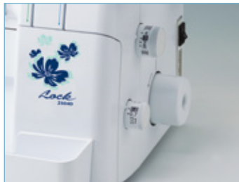
Easy access controls