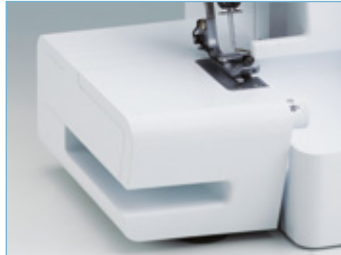
Free arm / Flat bed convertible sewing surface