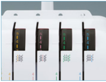
4 colour easy threading guide