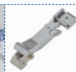
Gathering Foot SA213

For gathering and sewing in one operation.