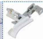
Pearls and Sequins Foot SA211