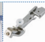
Taping (Elastic) Foot SA212

To attach tapes and elastic to stretch fabrics.