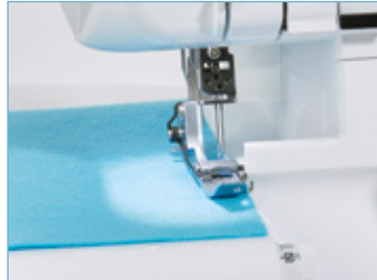
LED work light