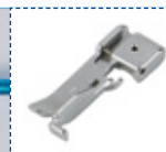
Piping Foot SA210

To attach piping between two layers of fabric.